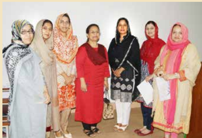
UMDC faculty members and other participants