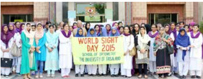
Awareness walk on world sight day

event. Blind students presented Kalam-e-Iqbal. Later on, students of OD-IX semester screened their documentary on blind people revolving around their visit to Al-Faisal blind school. Guests expressed their views regarding World Sight Day. An awareness walk took place at the end of the ceremony.