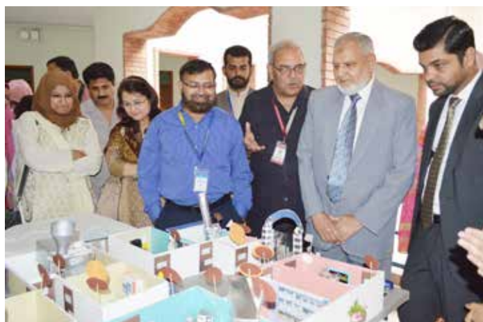
Guests visiting the stalls displayed by the students