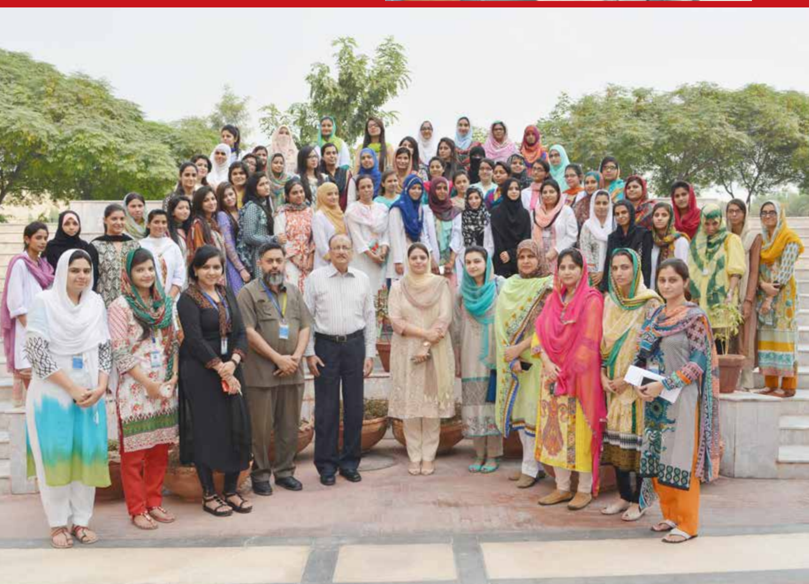
DPT Final semester students with Senior Management and Faculty members