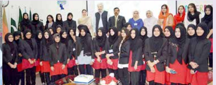
Cake cutting ceremony on World Internet Day