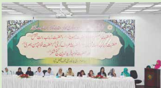
Participants of Quiz competition

University of Education, Samanabad, GC University for Women, Madina Town and Fatima Jinnah Degree College won the first, second and third positions respectively. The winners were awarded Prizes and Certificates.