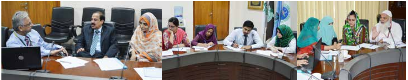
Group discussion session in CTL

faculty development; a fundamental step towards achieving the goal of quality medical education and ultimately better patient care.