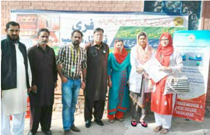
MTH team at Dental Camp

The activity will help the community in educating and raising awareness on oral hygienic problems for better health care. Dental Clinics, MTH will continue to provide this dental care facility in free camps till last week of December.