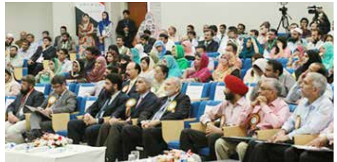
Participants of conference