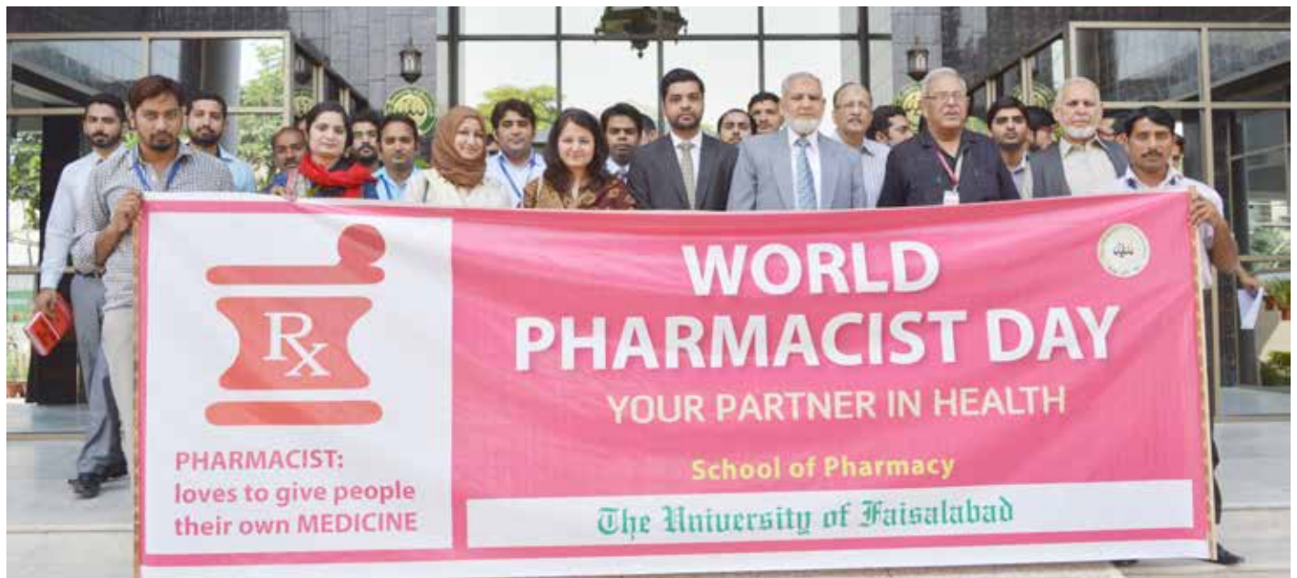
Awareness walk on World Pharmacist Day