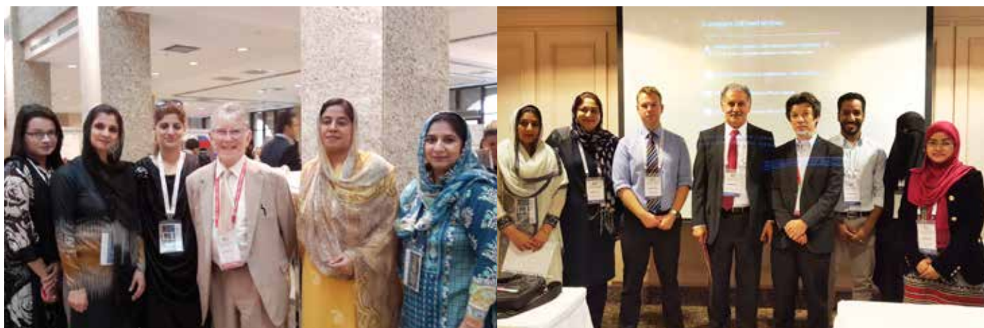
Team from UMDC in International Conference on Medical Education (ICME) 2015 -Turkey

The faculty also visited the transcontinental region famous for its mosques and rich cultural heritage. It was a wonderful learning experience and a delightfully proud moment for all.