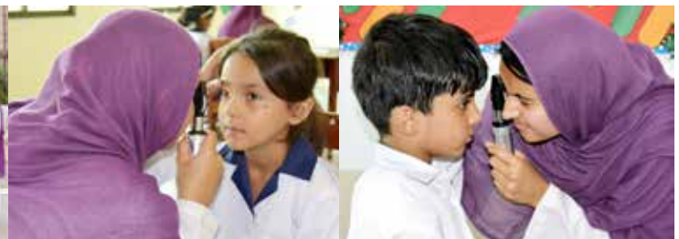
Vision screening process of UCS students