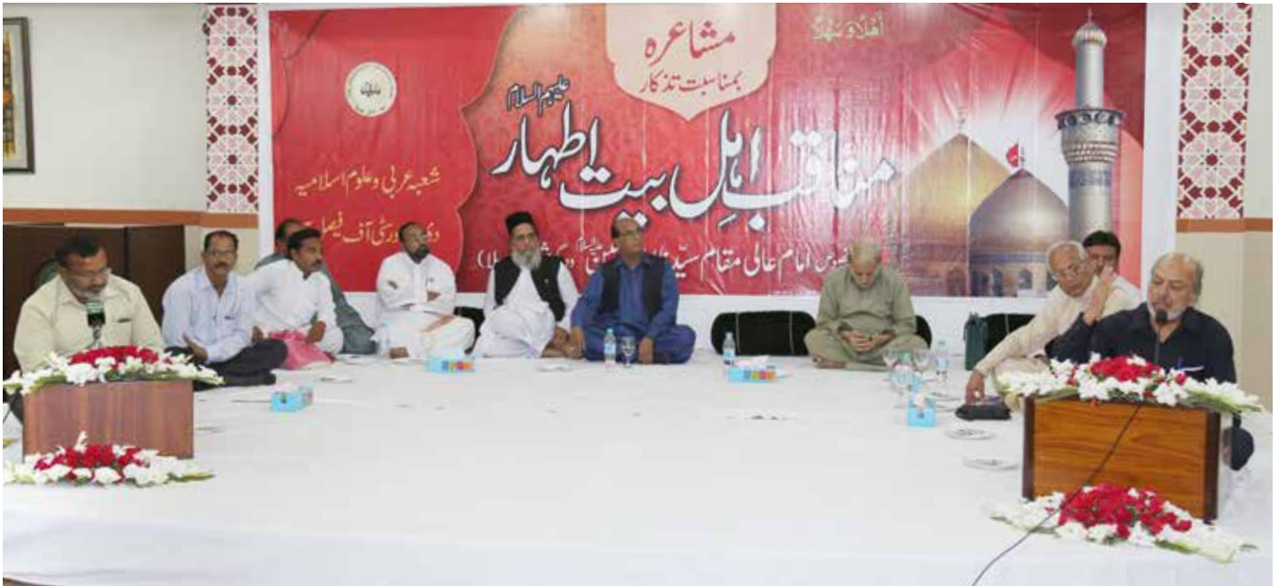
Poets paying tribute to Ehl e Baet Itehar during Mushaera at Amin Campus