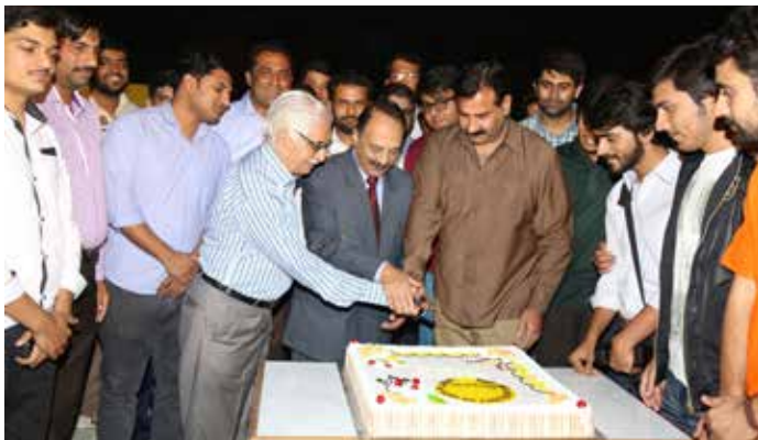
Welcome party for new comers in TUFIAN Hostel