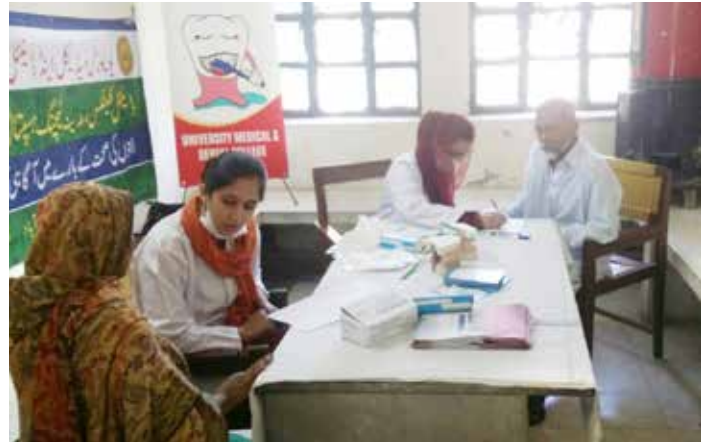
Doctors examining patients in the camp