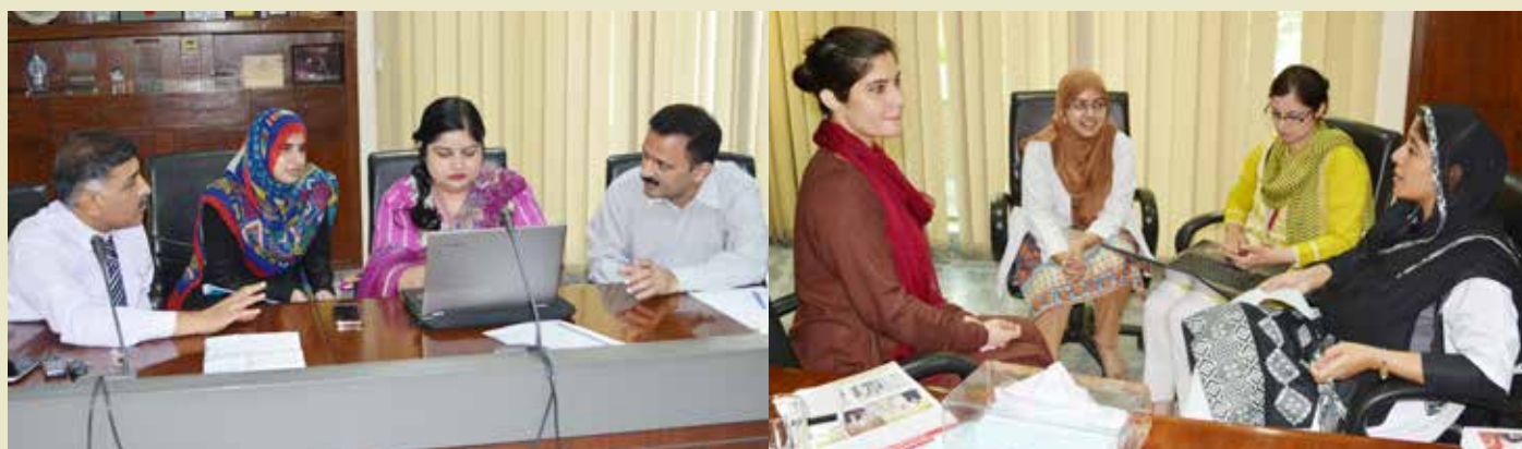
Group discussion session in CTL

to 4th November, 2015. It was a three-day contact session based on the theme "Assessment and evaluation of a teaching session". Workshops on constructing MCQs and