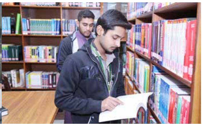
Students reading new books in the library