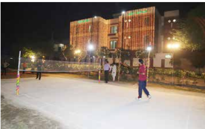
Sports activities in TUFIAN Hostel