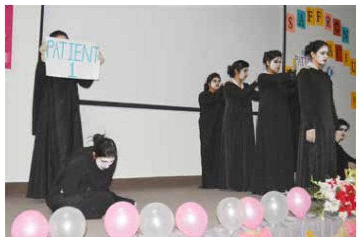
TUFIANS performing a skit on the importance of Pharmacist's Role