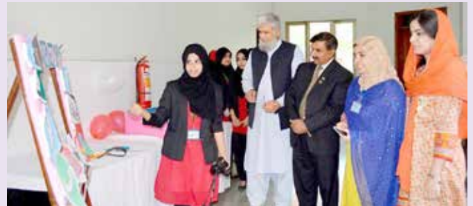
Students showing their projects