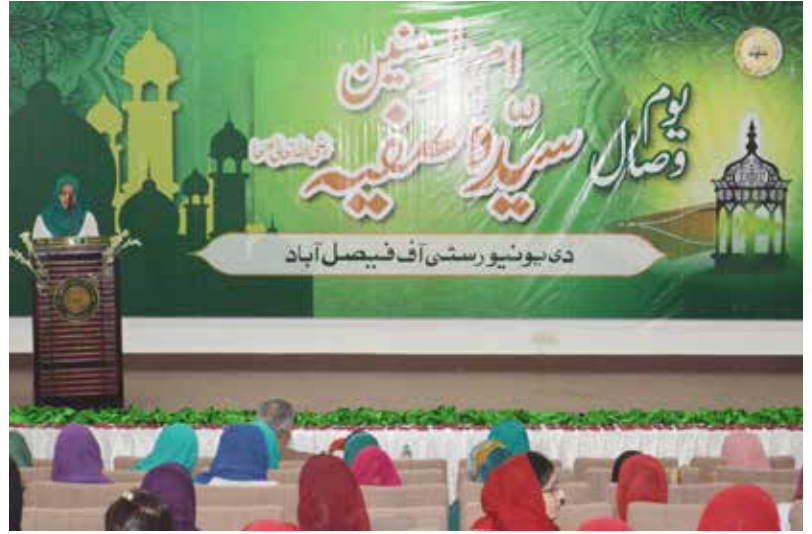
Student giving talk on the sacred life and character of Hazrat Safia (Razi Allah Ta'ala Anha)