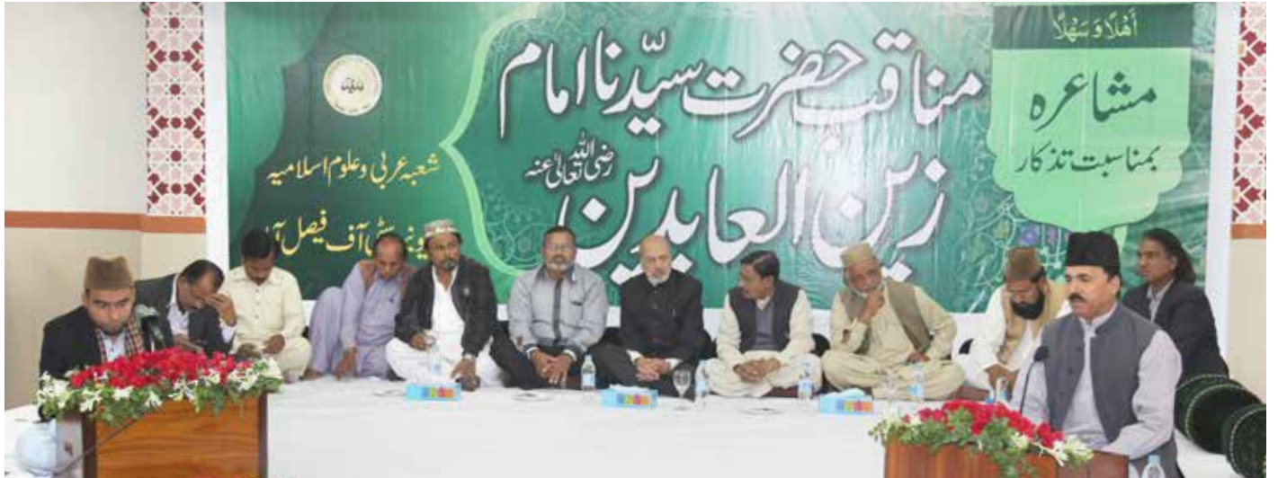
Poets offering Manaqib