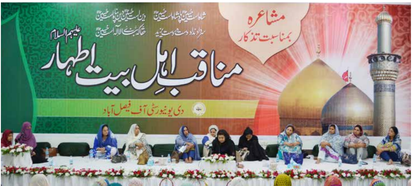
Poetesses paying tribute to Ehl e Baet Itehar during Mushaera at Saleem Campus