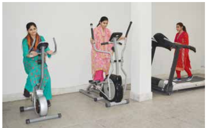
Students taking exercise in Gym at Girls Hostel